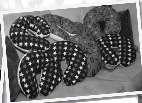
Patriotic Pillows from VA