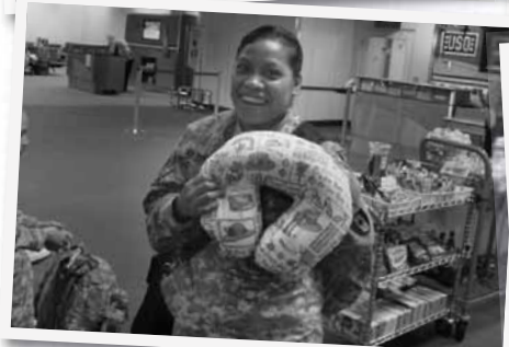
She loves the Red Hat Society pillow