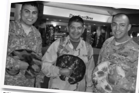
Pillows from Flatwater WAVES Unit 98, Nebraska