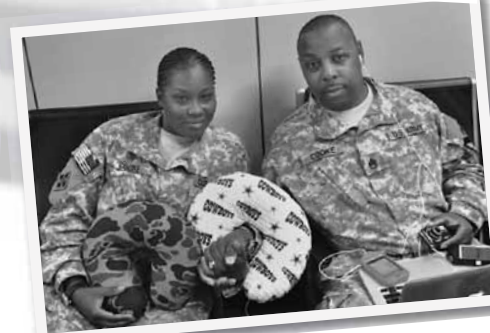
Cammo and Cowboys - DFW/USO