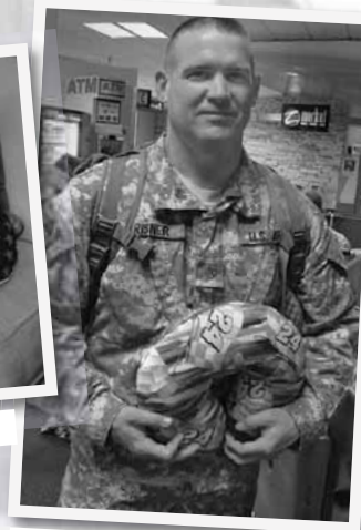
Army Major likes NASCAR

Soldiers waiting to go back to Iraq and Afghanistan - USO Dallas/Ft Worth (DFW) Airport